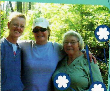
Conservation Team at the Big Sweep