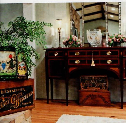
New furniture and accent pieces mix well with more traditional home furnishings.