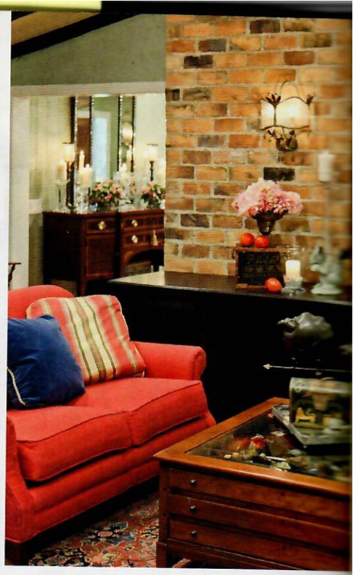
The traditional ranch house, decorated in a very relaxed, country style, now features lighter colors that bring the outdoors in.