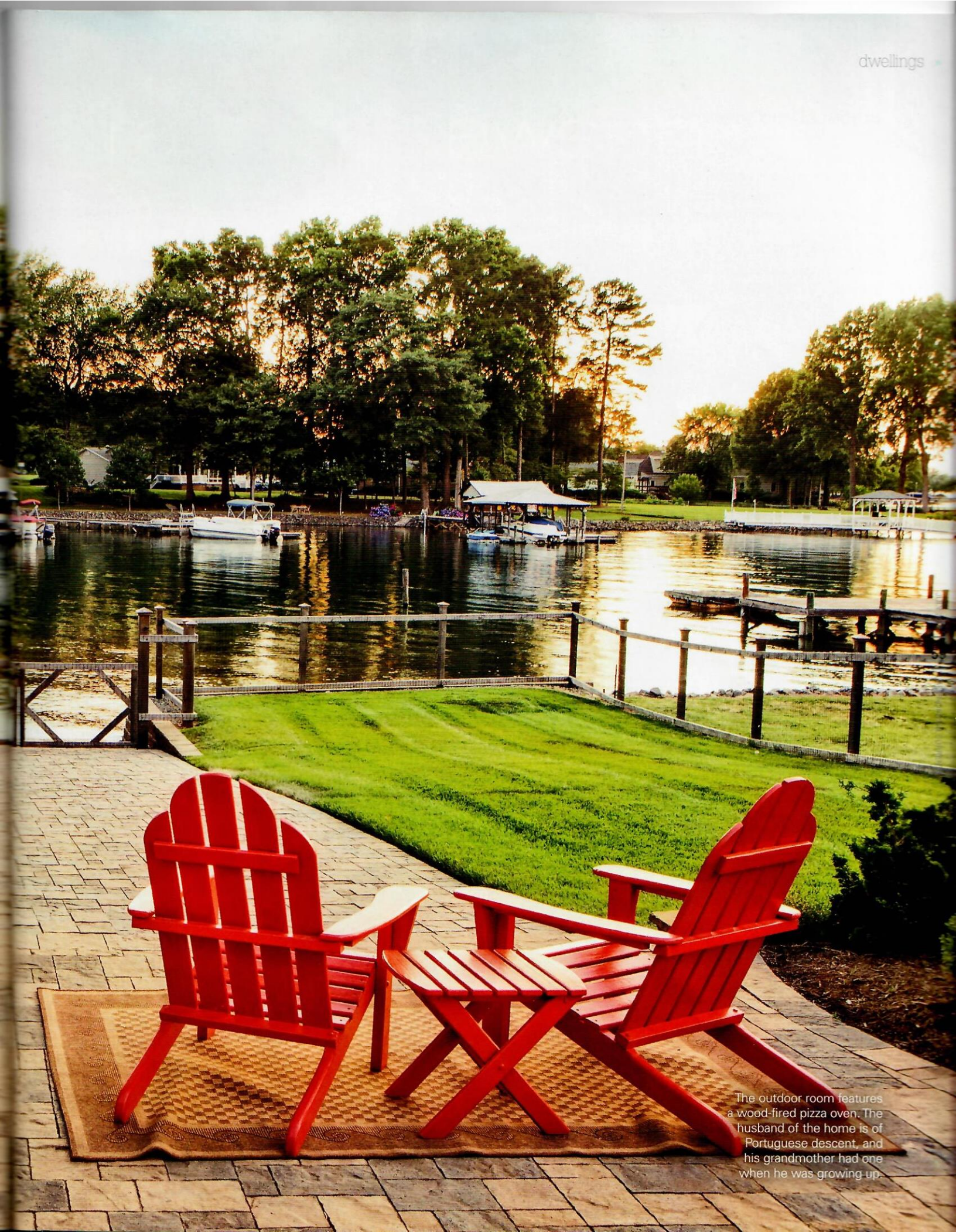
The outdoor room features a wood-fired pizza oven. The husband of the home is of Portuguese descent, and his grandmother had one when he was growing up.