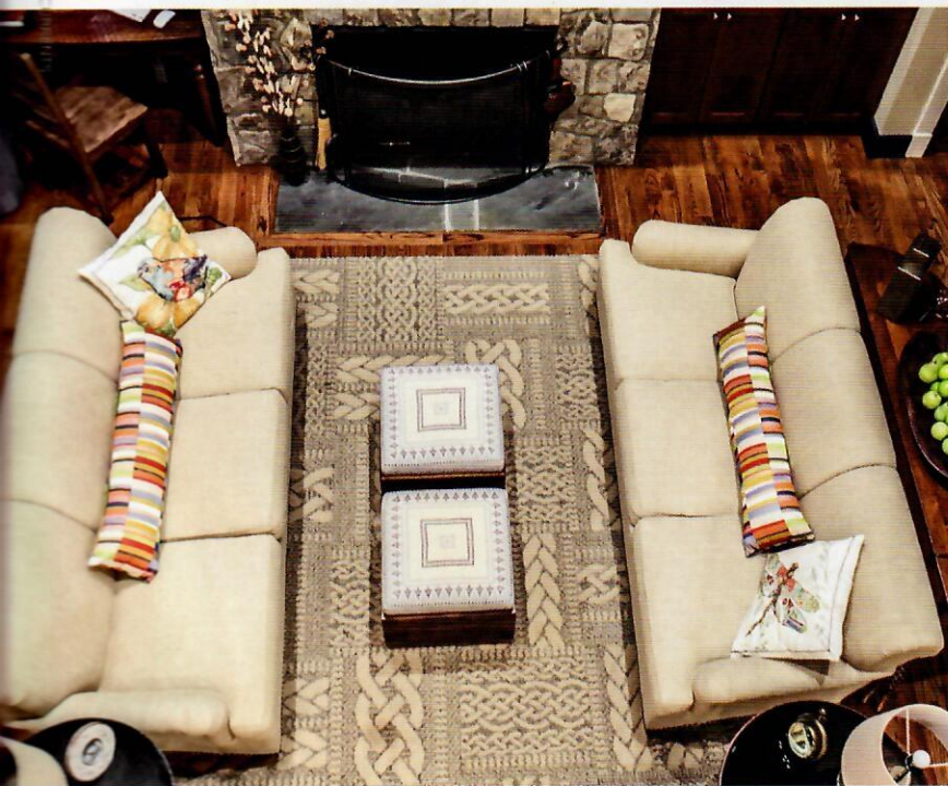
Custom slipcovers make the living room's sofas dog friendly.