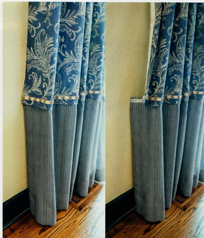
These draperies have “tear-away” bottoms so they can detach for easy cleaning in the event of pet “accidents.”

HUNTERSVILLE 16235 Northcross Dr | Huntersville, NC 28078 704.892.6466 | www.hugheshuntersville.com