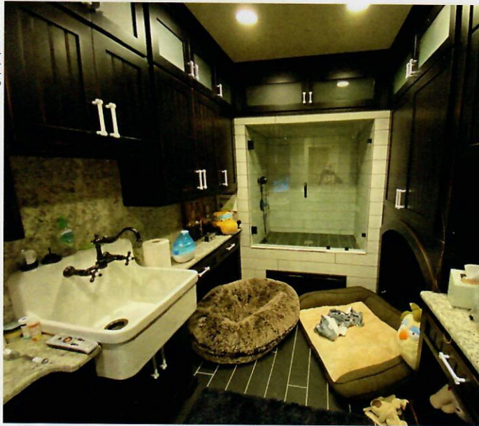
A room designed especially for one lucky dog named Bruno.

"For a family with a rambunctious pet, I always